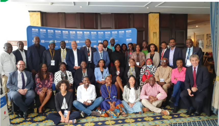
Expression and Safety of Journalist in Nairobi, Kenya from 29th November to 3rd December, 2021.